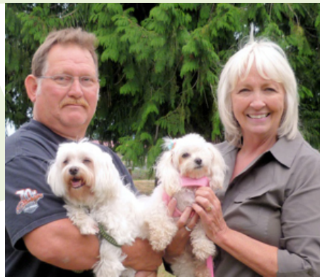
Dad, Zeus, Minnie, Mom

Minnie is a sweet, 5-1/2 pound Maltese who arrived at a Sacramento, CA shelter in November 2012. Only one year old, she had suffered an eye injury so severe her eye was protruding. The shelter veterinarian immediately tried to save it, but her eye had to be removed. Everyone except Minnie mourned. She is an exceptionally well balanced dog.